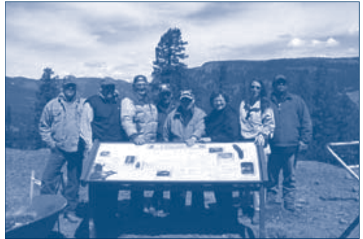
Members of the Los Caminos Antiguos board of directors gathered to install an interpretive sign in 2003.

Since that time, Colorado has received $13.4 million for more than 200 projects from the National Scenic Byways grant program. We have completed over