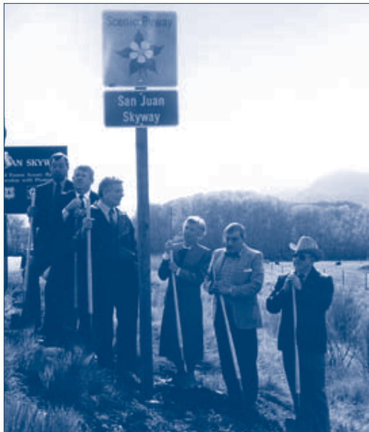
The very first Colorado Byway sign was installed on the San Juan Skyway in May 1990.

First came staffing the program. As outlined in the Governor's Executive Order creating the program, the Colorado Departments of Local Affairs, Natural Resources and Transportation originally provided staff to the Scenic and Historic Byways Commission. Two years into the program, department priorities changed and the staff from Local Affairs and Natural Resources withdrew from the byways program. For a number of years, the Department of Transportation, Office of Environmental Services provided a half-time staff member (the historian) to manage the program. In 1999, the State scenic byways program coordinator position was transferred to the Division of Transportation Development as a full-time position, where it remains today.