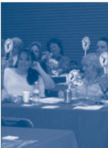
The Colorado Grassroots Training program: consultant free and lots of fun!

Now we are looking forward to welcoming the National Scenic Byways Conference to Denver. We've hosted regional workshops for the National Scenic Byways Program in 1995 and 1998. But this time, we are celebrating our 20th anniversary and are excited for the opportunity to showcase all that has been accomplished. Come help us celebrate! ★