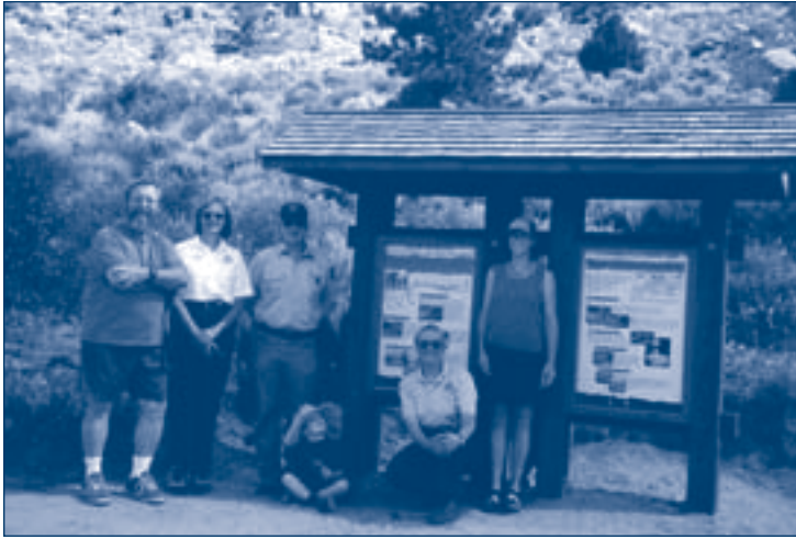
The Cache la Poudre-North Park byway committee at the dedication of a kiosk.

we've identified three things that make a byway organization successful.