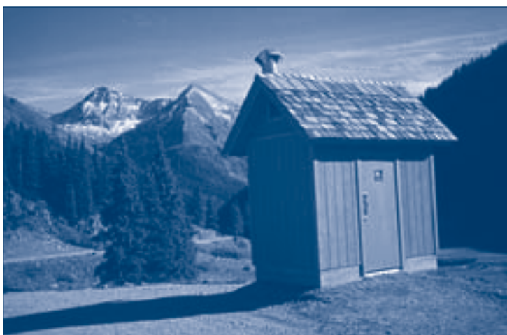
One of the very first byway grants was a restroom (the first of many) on the Alpine Loop near Animas Forks.

After observing local byway organizations for twenty years,