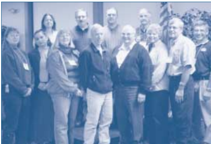
In October 2002, North Dakota held its first conference for representatives from the state's seven scenic byways. Sheyenne River Valley Scenic Byway is the first route in North Dakota to receive national designation.