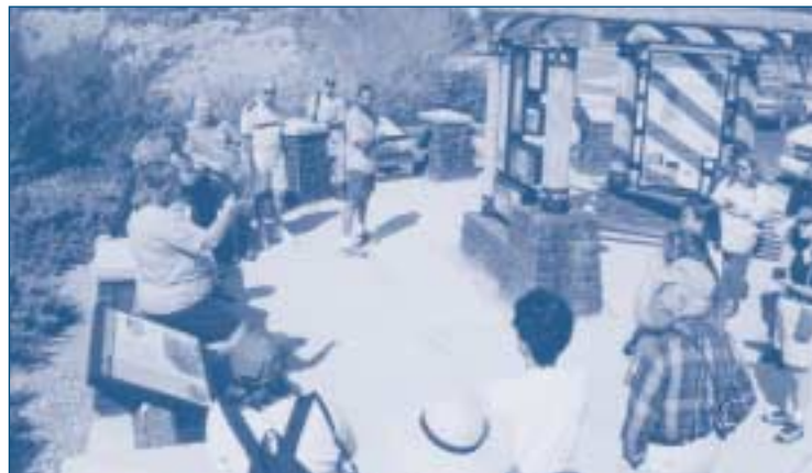
Participants at the 2003 National Scenic Byways Conference will have the opportunity to learn in a variety of ways, including field workshops.

Defining The Learning Possibilities With a vision to create a distinctive collection of American roads, their stories and treasured places, staff members of the ABRC and FHWA's National Scenic Byways Program joined together for a strategic planning session to set out more than a year's worth of work toward that vision.