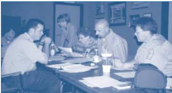
It's important to understand the various layers of community involvement. "Active citizens" are those individuals who are already involved with your byway organization. They have different needs and motivations than the "concerned public" or "general public."

By tailoring your communication and outreach to the various layers in your community, you'll build a stronger foundation for your byway. ★