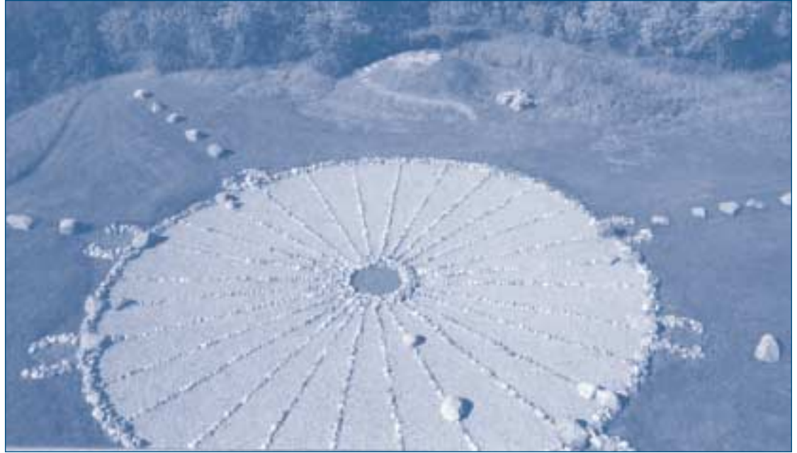
Medicine Wheel Park, located in Valley City, features a reproduction of a Medicine Wheel (a stone solar calendar), honoring the site of a massive Native American burial mound complex.

designated byways in eight states to learn about visitor centers, marketing and interpretation. When the project is complete, visitors will learn the byway's story at 27 interpretive sites, seven map panel locations and a new visitor center.