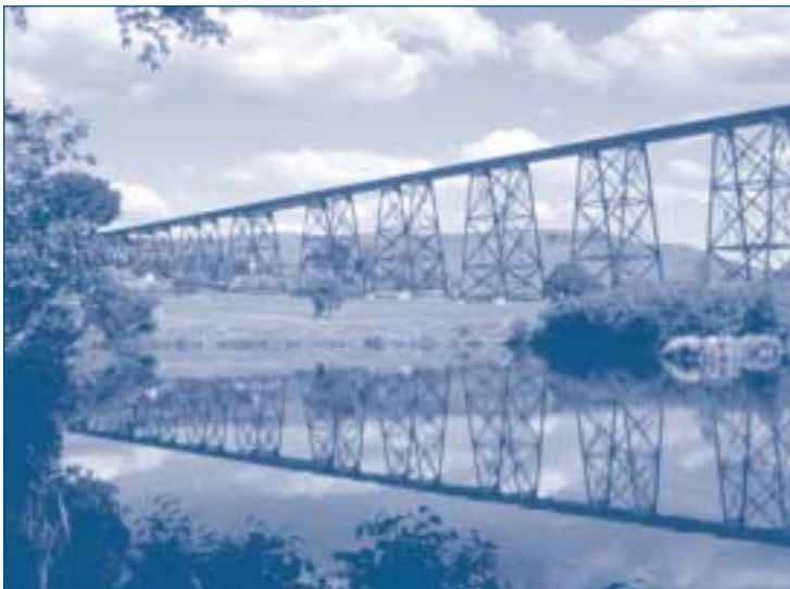
The High Line Bridge (shown here) is 3,860 feet long and stands 162 feet above the Sheyenne River. Eight unique bridges are interpreted as part of a historic bridges tour in Valley City. An International Volksmarch follows the bridge tour route.

Recreational opportunities abound. You can enjoy snowmobiling, birding, canoeing, hunting, fishing, hiking, golfing, cross-country skiing and, surprisingly, downhill skiing.