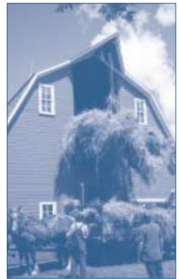
Twice a year, Sodbuster Days celebrates traditional farming techniques like haying, cutting, shocking grain, threshing and field preparation. The popular events are held at the Sunne Farm within Fort Ransom State Park.

The cultural heritage reflects a mixture of customs and traditions passed on from the region’s first