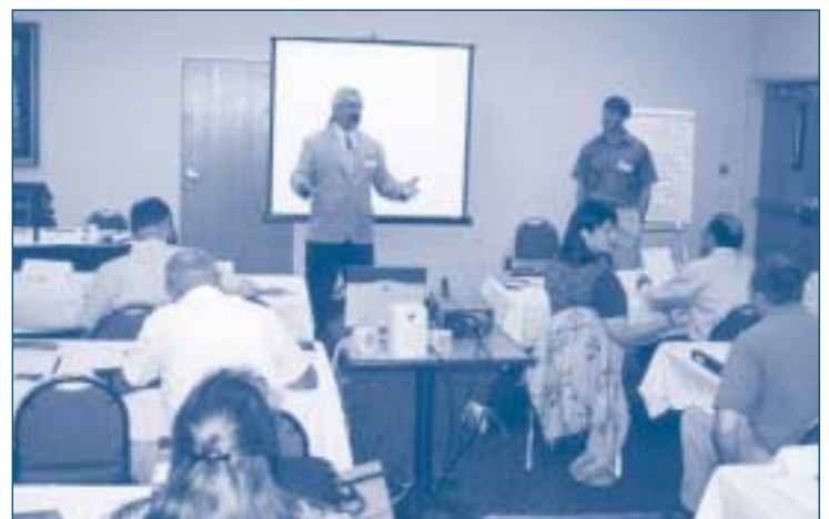
The 2003 National Scenic Byways Conference offers several training formats, such as classroom-style discussions.

Every byway is about places and stories. Every corridor in the collection is a treasure for the nation. We hear the requests for information and technical assistance that are held in common across the program. We hear the need for personalized attention.