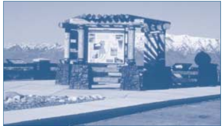
This kiosk orients visitors to the byway, tells about tourist attractions in nearby Cache Valley, interprets information on the Forest Service and has timelines of the geological and historical forces that shaped Logan Canyon.

The session on financial and technical assistance revealed a variety of federal programs that can be tapped for both assistance and funding. Check out www.cfda.gov for a listing of all federal assistance programs. The Land and Water Conservation Fund can be a source of funds for both federal and state projects related to parks, outdoor recreation, and