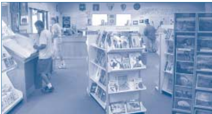
The Moab (Utah) Information Center demonstrates the positive benefits of public-private partnerships. This center not only provides visitor information, but has become a source for community education with free lectures and activities for children.

This was the sixth educational conference sponsored by the Western States Tourism Policy Council and its federal partners. WSTPC works to support the conservation, preservation and protection of federal and tribal lands while raising the awareness of the important role they play in the development of sustainable tourism in the gateway communities that border them. ★