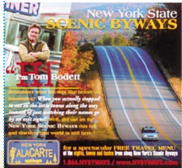
Print and electronic ads featured celebrity spokesperson, Tom Bodett (right). A 32-page byway guide was developed for the Fall campaign (opposite above).

PUTTING IT ALL TOGETHER. Substantial work at the local, regional and state levels during the 1990s to plan, develop and market New York's Scenic Byways led to an increased understanding of the importance of working with tourism partners to effectively establish name recognition and appreciation for the byways. The idea of "branding" the byways was developed in 2002 as a coordinated effort between ANCA and NYSDOT to develop a multi-media "Fall Marketing Campaign." The goal was to create an identity for New York's State's Scenic Byways and offer the byways as a fall foliage travel option to consumers planning "leaf peeping" trips in New York. The use of a celebrity