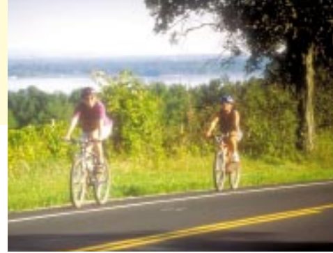
Bicyclists along Lakes to Locks Passage.

This project was successful because of a number of factors. Is your byway implementing similar best practices?