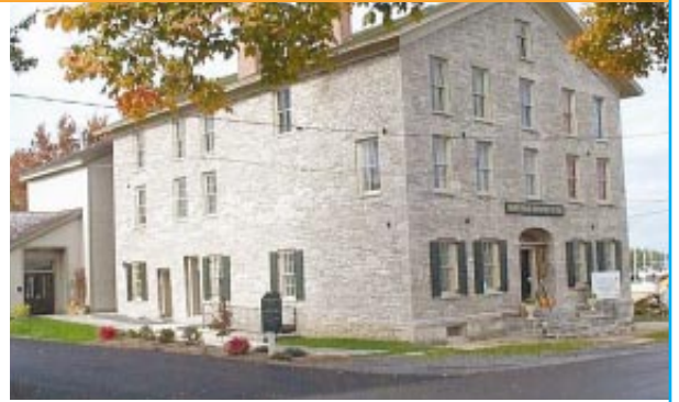
Seaway Trail Discovery Center, Sackett Harbor, NY.